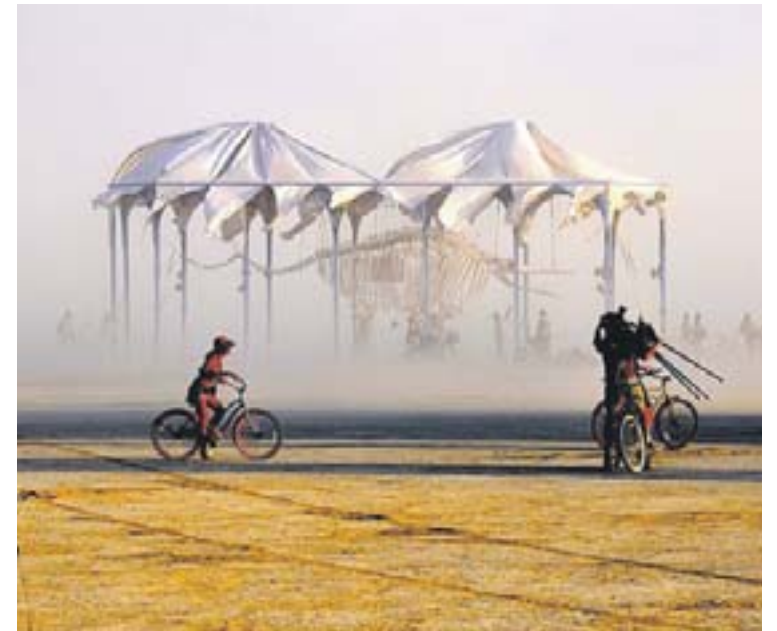
50-foot, life sized fish-like creature resembles the ichthyosaur Photos provided

Their resumés are frequently patchwork: occupations like chemist, mountain climber, marine biologist, firefighter often stitch themselves to writer, sculptor, musician, dancer. Most people think of them as solitary individuals with a certain rough texture to their personalities that indicate either genius vision or outright unsociability.